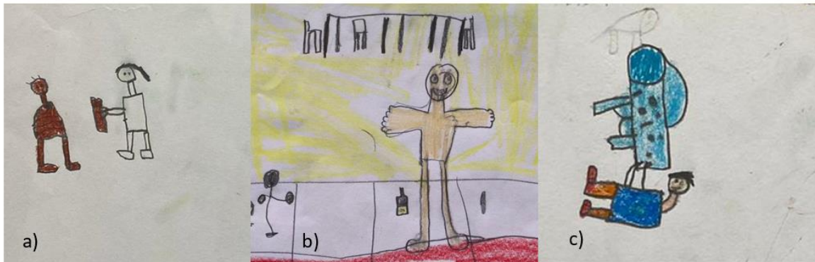
Figure 4. Secondary school student drawings (a) Student 2's scientist and human figure, (b) Student 3's scientist figure, (c) Student 2's scientist and an animal figure

In another case, unlike the opinions of primary school students, middle school students shared the drawings of a friend and a teacher (Table 4). Similarly, it was observed that students 1 and 6 responded to the question of what middle school students were interested in with the expressions "playing a game" and "experimenting", respectively, while no explanation was given in the other interviews. A few situations that were not encountered in the student interviews but were seen in the drawings were shared in Table 3 as "human-like... creature experiments" as an alternative image. Examples of this are shown in Figure 4.