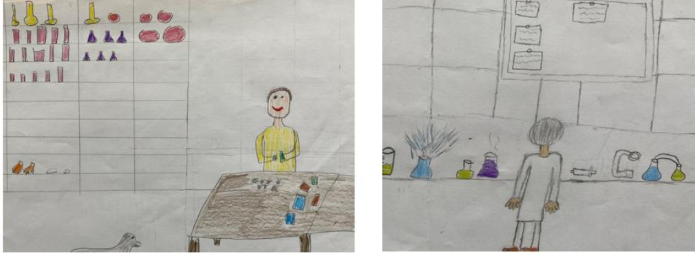
Figure 3. Secondary school student drawings (a) Student 5's drawing of a regular room (b) Student 6's drawing of a laboratory

When the expressions of the middle school students are analyzed, it is seen that the expression "laboratory" is used intensively and the student number 5 used the expression "a regular room". Figure 3 shows regular room and laboratory views.