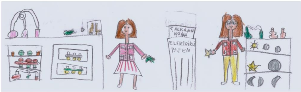
Figure 2. Primary school student drawings section from the drawing of 3rd grade student number 3

When Figure 1 is analyzed, picture (a) shows an explosion and a human face covered in smoke. This situation was shared as an alternative image represented as an explosion (Table 3). In addition, Table 4 explains that the students interviewed at the 3rd grade level drew Albert Einstein in their drawings. In this class, only student number 5 stated that he drew his friend as a scientist (Figure 2).